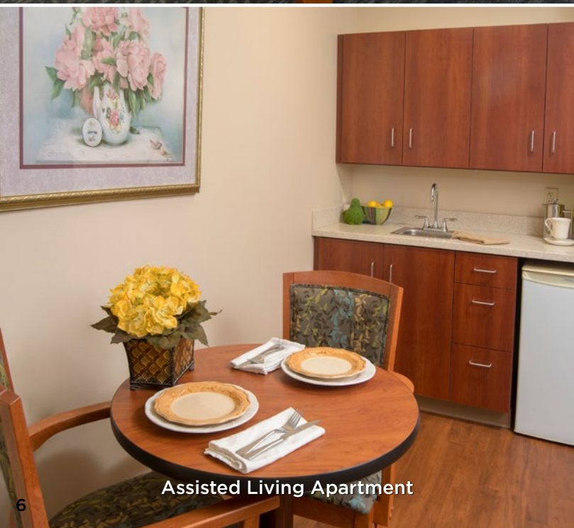
Assisted Living Apartment